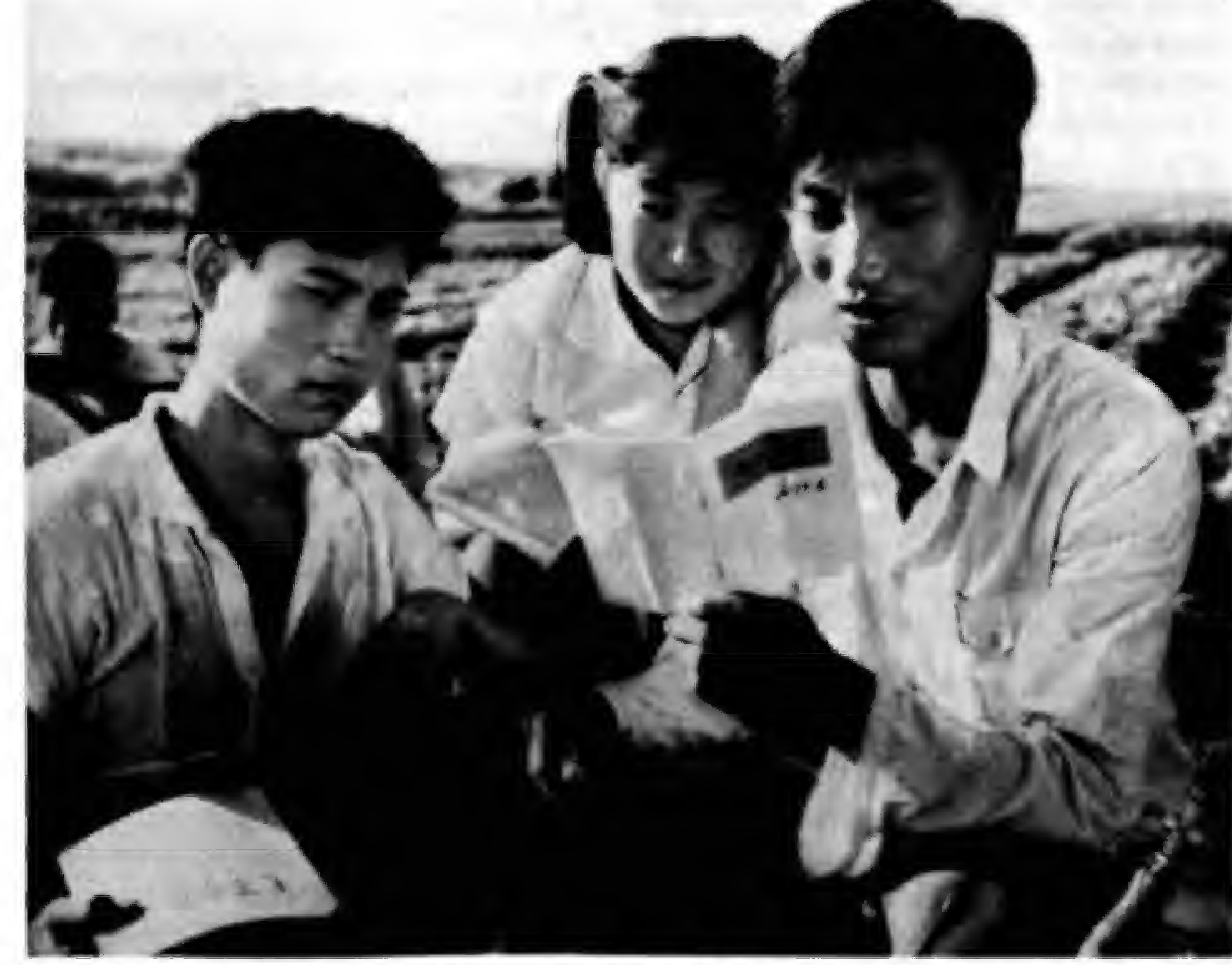
On the site of a water conservation project, young people study The Foolish Old Man Who Removed the Mountains.

Under the encouragement of Chairman Mao's comments, we waged our next hard-fought battle, harnessing the Tashan River. Running along the foot of a big mountain west of the village, it was a strange river. It flooded seriously when mountain torrents came. But in ordinary times water could not be seen in the river, for it ran beneath the sandy, stony bed. Could this sub-surface water be used for irrigation? It could. In 1958 the Party branch decided to build a dam to check the underground water.